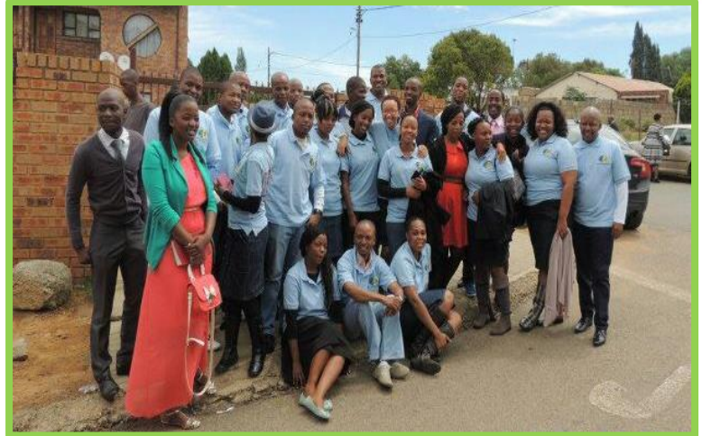
Ready for action, the Youth take a moment to pose for the camera before heading out to do community service.