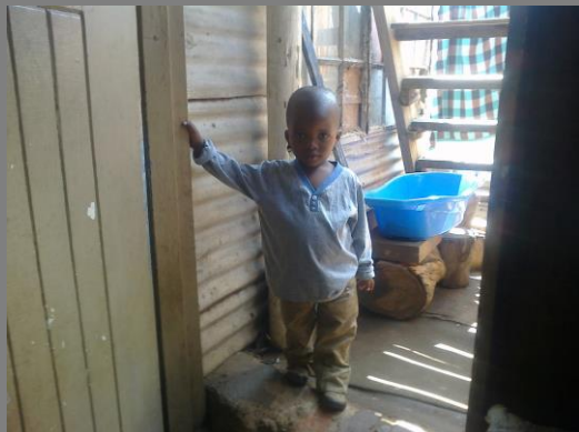
The finished work, shelter from the cold