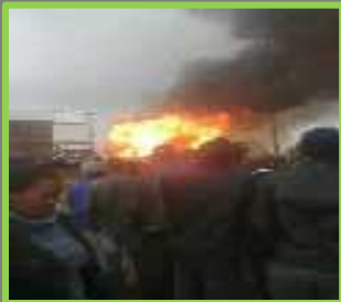
The ruin, the fire destroying the shacks

Our church gave the much needed relief to the family and the neighbors. And the pictures herein tell it all.