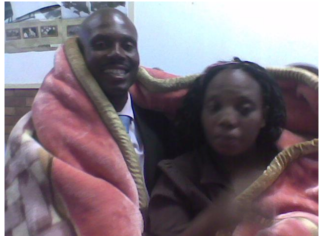
And blankets, to keep away the cold

Blessed is the hand that giveth than the one that receiveth!