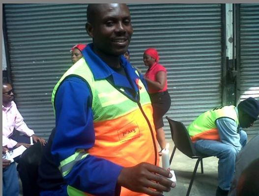
The work, putting the pieces back together